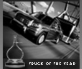
TRUCK OF THE YEAR