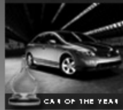
CAR OF THE YEAR